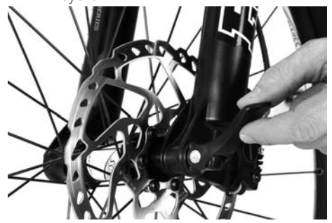
Figure 53: Fitting the Cross front wheel axle system

No tools are needed to remove the front wheel of the PORSCHE eBike Cross. Open the quick release lever on the axle and push the lightly greased axle through the hub until the thread engages with the dropout. Tighten the axle and apply the tension by turning the clamping lever upwards through 90°.