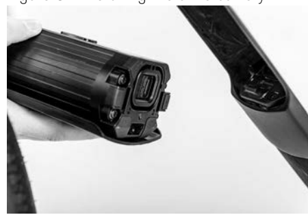
Figure 32: Installing the drive battery

Finally, secure the drive battery in the down tube. To do this, put the key in the lock cylinder on the drive battery holder at the top end of the down tube on the left-hand side of the frame and turn it clockwise.