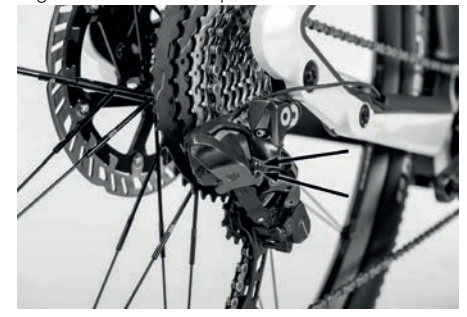
Figure 25: Limit stop screw

If you cannot adjust the gear shifting using this method, the system must be checked by the ROTWILD authorised dealer.