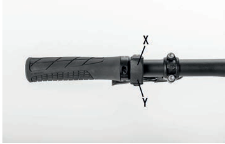
Figure 6: Support switch (X/Y)

You use the support switch (X/Y) to select the level of support you want while you are riding. If you press the top button (X), you increase the level of support. To reduce the level of support, you press the bottom button (Y).