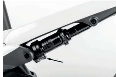
OPEN, MEDIUM, FIRM.