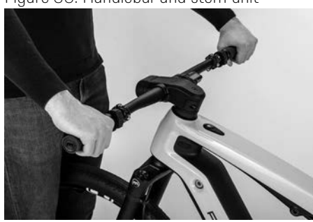
Figure 35: Handlebar and stem unit

Make sure that the handlebar and stem cannot be turned in opposite directions by clamping the front wheel between your knees and trying to turn the handlebars.