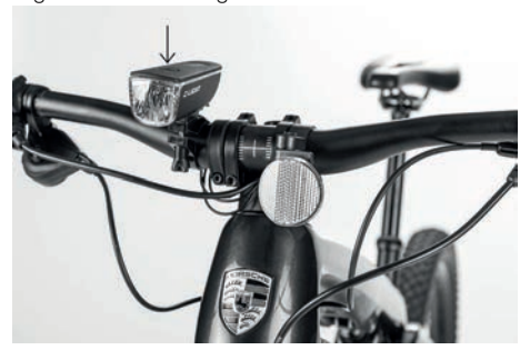
Figure 58: Front light

The rear light is fitted at the bottom of the seat post.