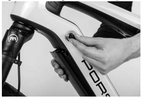
Figure 33: Securing the drive battery

Finally, secure the drive battery in the down tube. To do this, put the key in the lock cylinder on the drive battery holder at the top end of the down tube on the left-hand side of the frame and turn it clockwise.