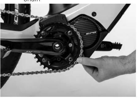
Figure 22: Checking the condition of the chain

Replacing your chain regularly can extend the life of your chain rings and cassettes. To check the condition of the chain, pull it away from the chain ring with your thumb and first finger. If you can pull the chain a long way away from the chain ring, it is stretched and needs to be replaced. Your ROTWILD authorised dealer can carry out a more accurate check of your chain using special tools.