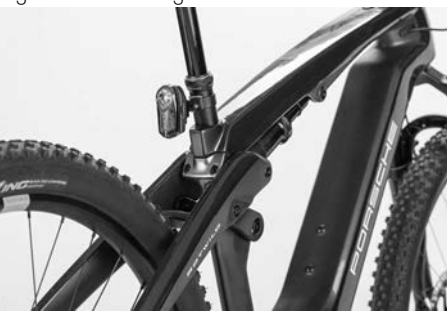
Figure 59: Rear light

Both lights are supplied with suitable bolts. These must be tightened to a torque of 4 Nm.