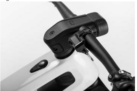
Figure 3: ON/OFF switch