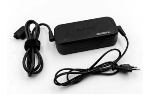
Figure 34: Charger

The drive battery must only be charged using the charger supplied with the eBike. If you use another charger, you could cause a fire or an explosion.