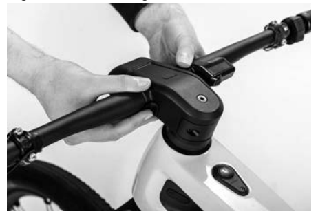
Figure 37: Checking the stem

A loose stem can cause a crash. Check that the stem is held securely in position by the shaft clamp and the handlebar clamp.