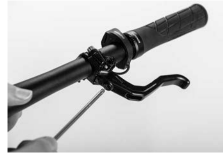
Figure 19: Brakes / grip width

If the brake lever cannot be adjusted or is not safe, it must be checked by the ROT-WII D authorised dealer.