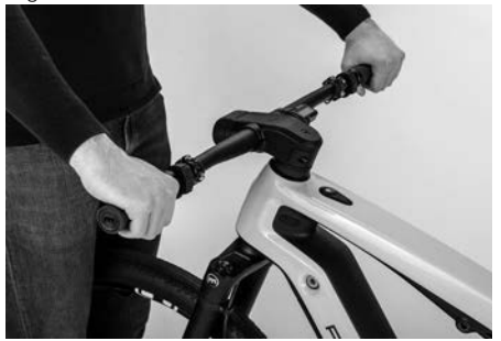
Figure 17: Handlebars and stem