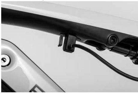
The charging process starts automatically.

Figure 7: Charger cable connector and drive battery.