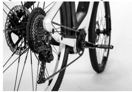
Figure 18: Chain on the chain ring/cassette

Check that the chain is on the front chain ring and the rear cassette. If the bike fell on the dérailleur side, damage may have been caused. Try shifting through the gears and make sure that the rear dérailleur and/or the dropout, which could be bent, are not too close to the spokes of the rear wheel.