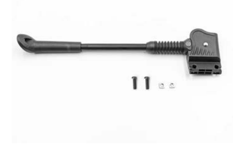
Figure 55: Side stand

Firstly, remove the cover from the stand mount on the left-hand chainstay.