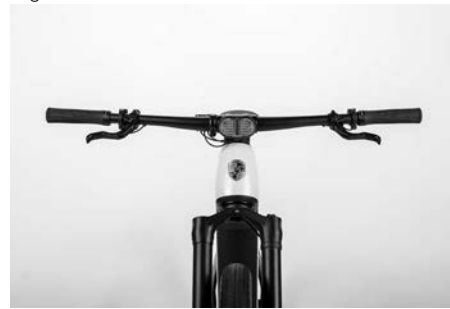
Figure 13: Front and rear brake levers.

In countries that drive on the left, the lefthand brake lever operates the rear brake and the right-hand lever operates the front brake.