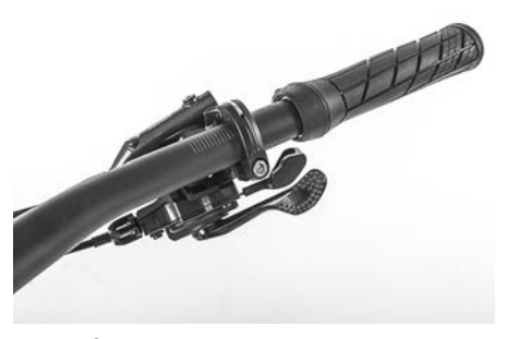
Figure 24: The position of the shifting lever (electronic)