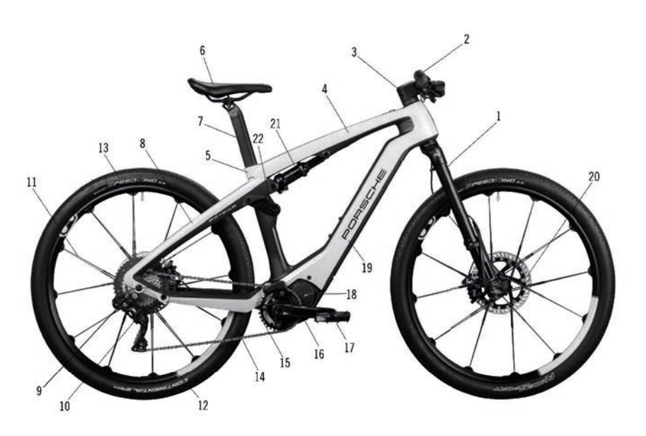
Figure 4: Detailed information about the PORSCHE eBike