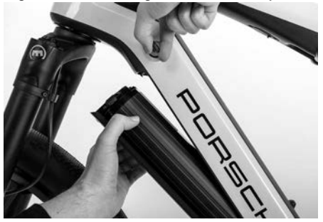
Figure 31: Removing the drive battery