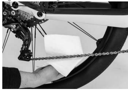
Figure 20: Cleaning the chain

The drive system must be completely switched off during maintenance and repairs to ensure that an accident does not occur. To switch off the system, remove the drive battery.