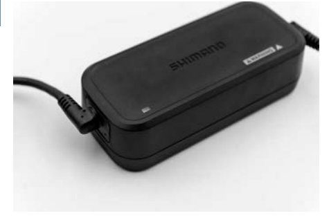
Figure 26: Overview of the indicator lights.

Make sure that you read the instructions for the charger.