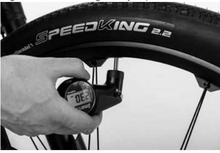
Figure 12: Checking the tyre pressure.

You should never let the tyre pressure exceed the maximum limit or fall below the minimum limit.