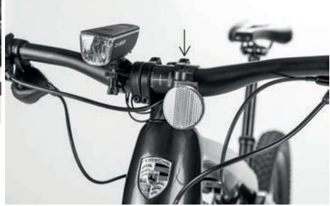
Figure 62: Fitting the front reflector

The front light is fitted on the handlebar to the left of the stem.