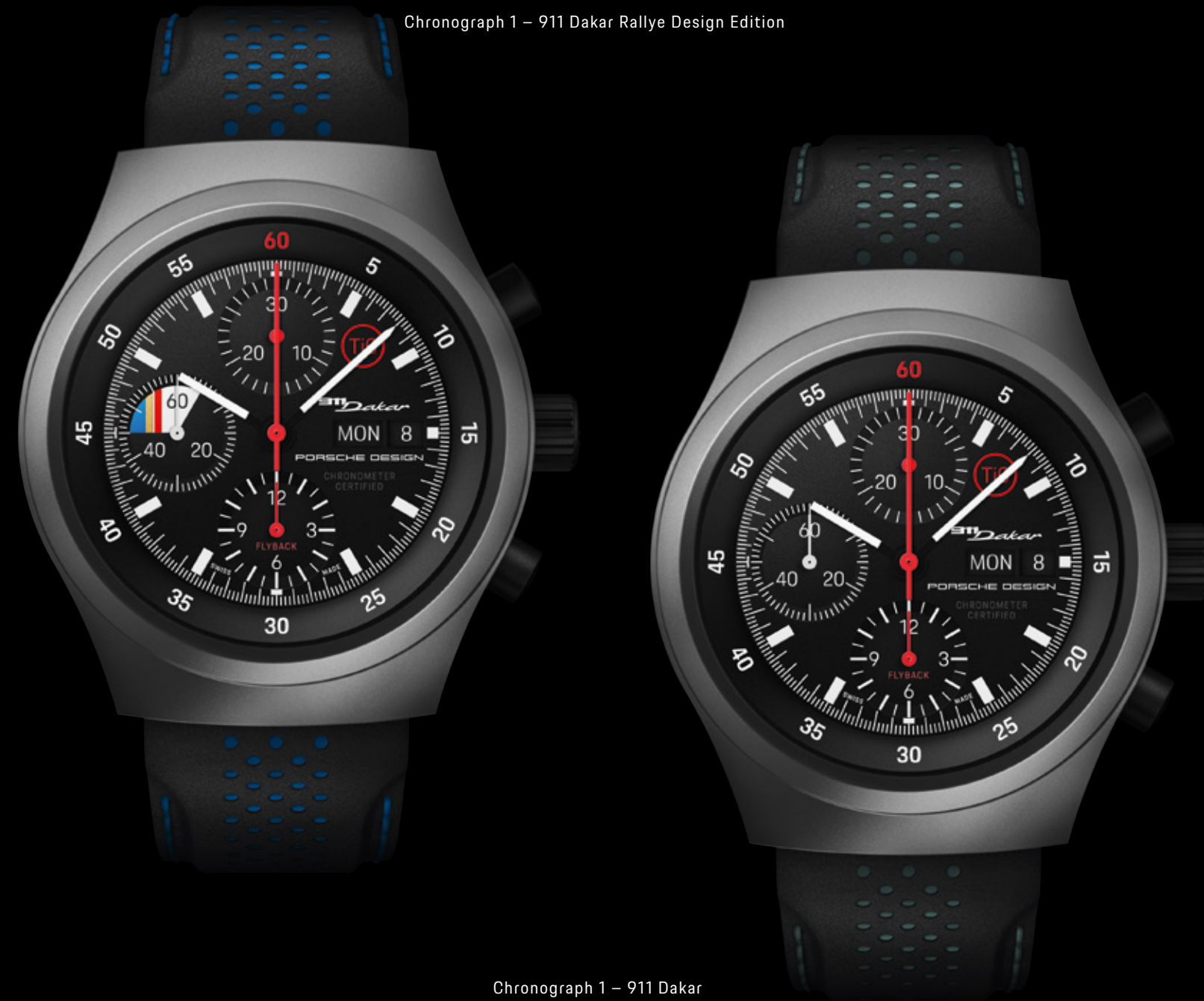
Chronograph 1 – 911 Dakar