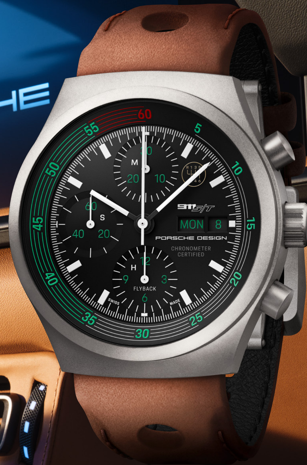
Chronograph 1 – 911 S/T Heritage