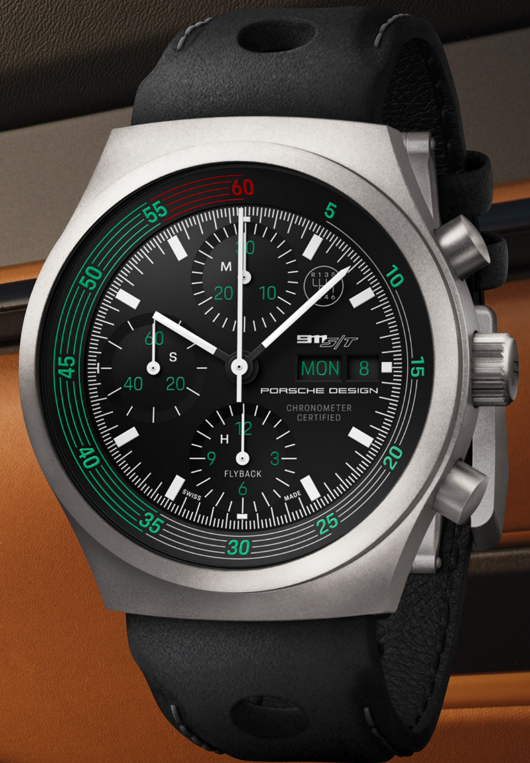
Chronograph 1 – 911 S/T