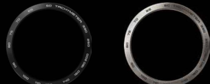
Black titanium, Tachymeter