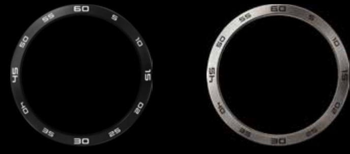
Black titanium, Minuterie