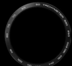
Black titanium, Tachymeter