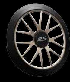
White Gold Metallic