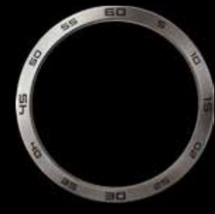
Natural titanium, Minuterie