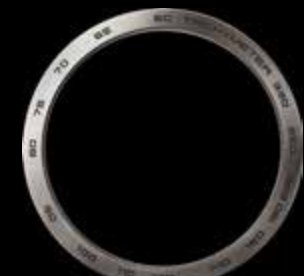
Natural titanium, Tachymeter