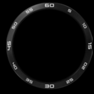
Black titanium, Minuterie