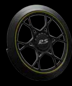
Black with coloured ring in Racing Yellow