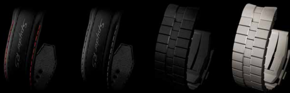
Black leather, stitching in Carmine Red